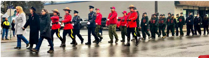
Remembrance Day Ceremony