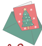
Card Making & Crochet at Stewart Public Library