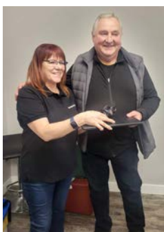
Newmont Computer Safety for Elders